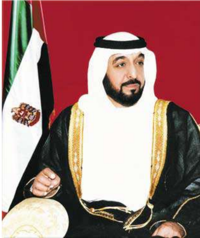
His Highness Sheikh Khalifa Bin Zayed Al Nahayan President of the United Arab Emirates