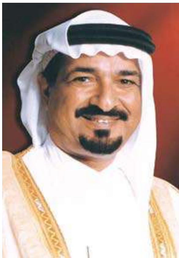
His Highness Sheikh Humaid Bin Rashid Al Nuaimi

Member of the Supreme Council Ruler of Ajman