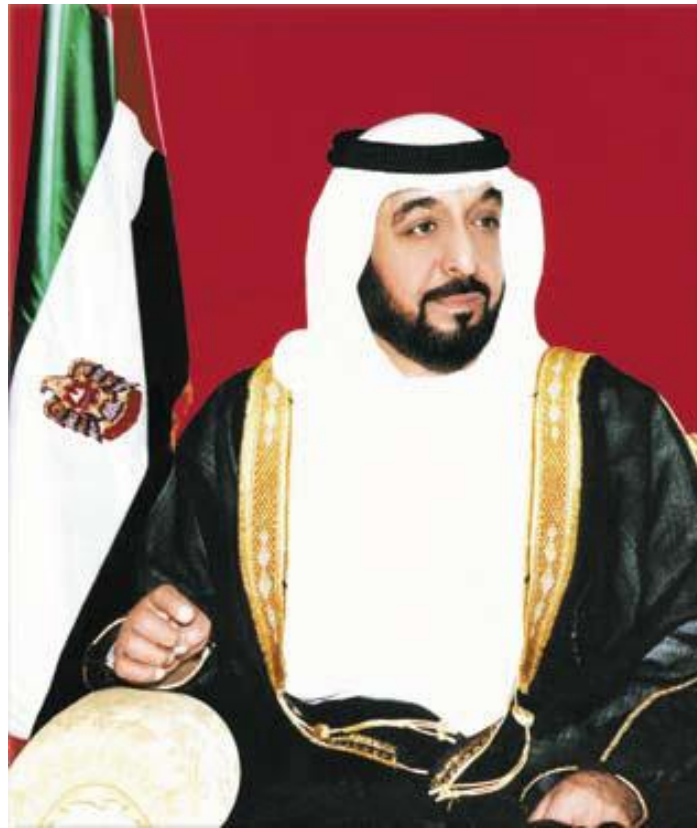
His Highness Sheikh Khalifa Bin Zayed Al Nahayan President of the United Arab Emirates