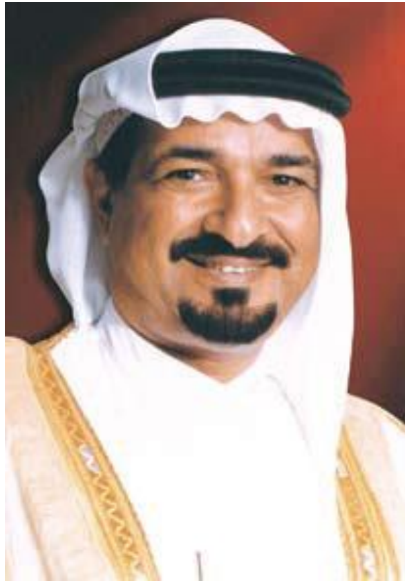
His Highness Sheikh Humaid Bin Rashid Al Nuaimi Member of the Supreme Council Ruler of Ajman Patron of Ajman University