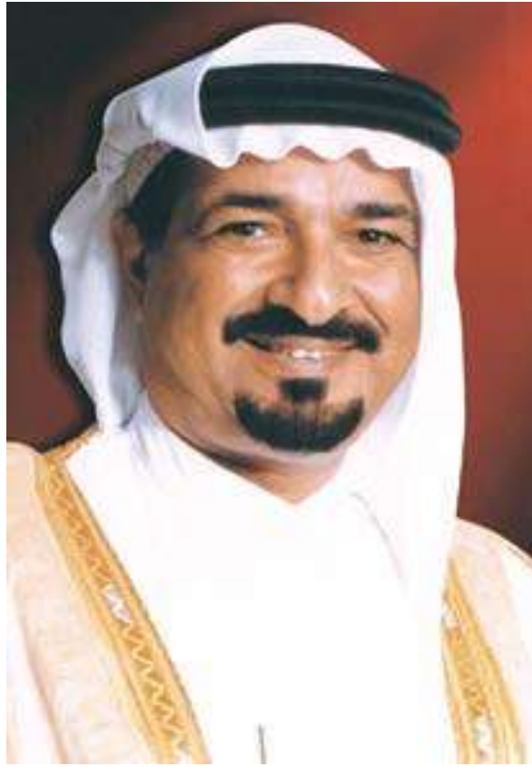
His Highness Sheikh Humaid Bin Rashid Al Nuaimi Member of the Supreme Council Ruler of Ajman Patron of Ajman University