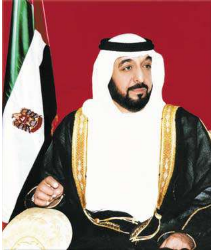
His Highness Sheikh Khalifa Bin Zayed Al Nahayan President of the United Arab Emirates