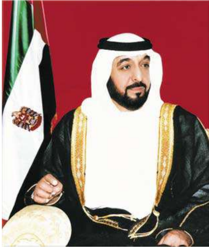
His Highness Sheikh Khalifa Bin Zayed Al Nahayan President of the United Arab Emirates