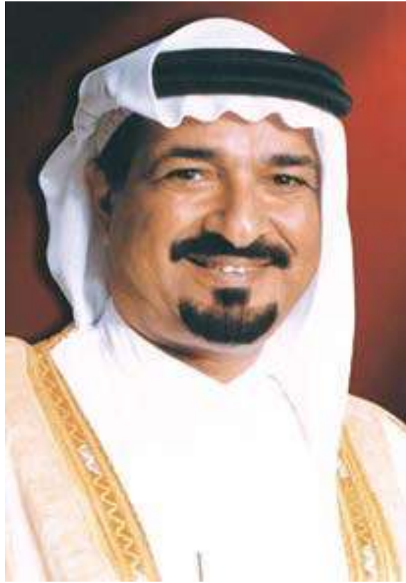
His Highness Sheikh Humaid Bin Rashid Al Nuaimi Member of the Supreme Council Ruler of Ajman Patron of Ajman University