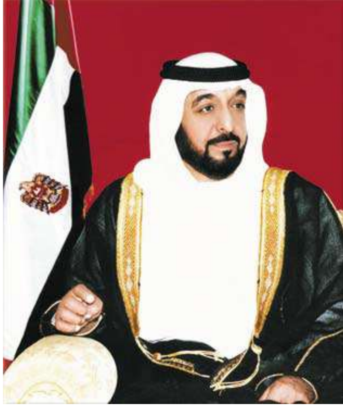
His Highness Sheikh Khalifa Bin Zayed Al Nahayan President of the United Arab Emirates