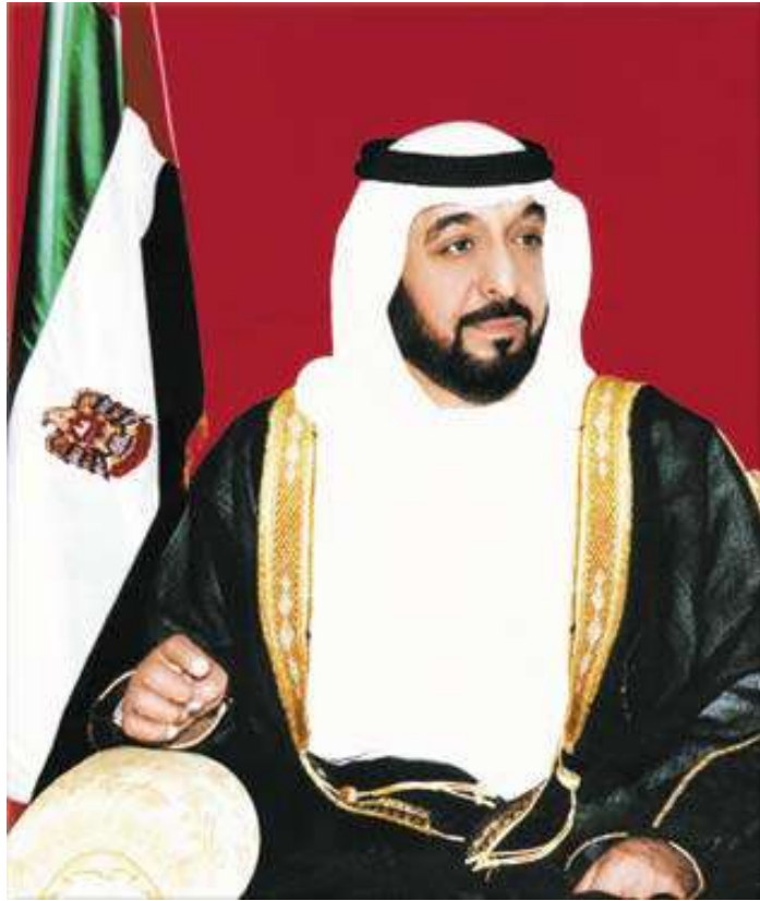
His Highness Sheikh Khalifa Bin Zayed Al Nahayan President of the United Arab Emirates