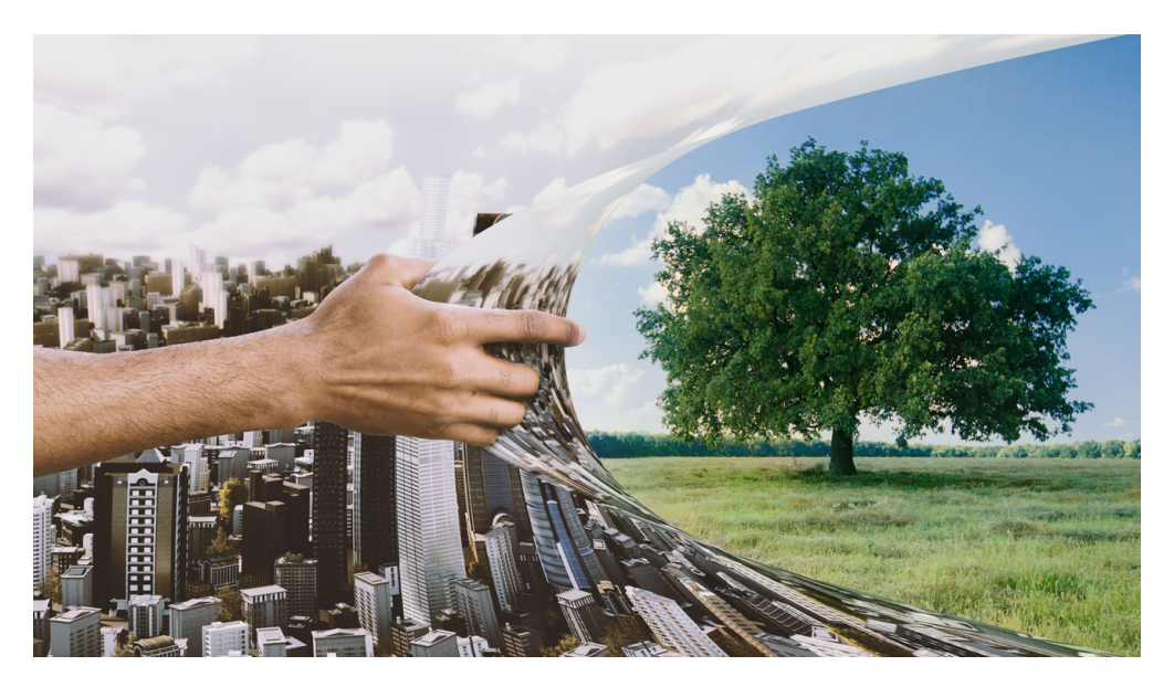
Ajman University // AU SUSTAINABILITY CLUB 2023